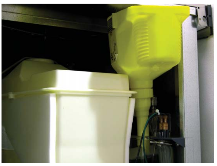
10. Insert funnel in reservoir,