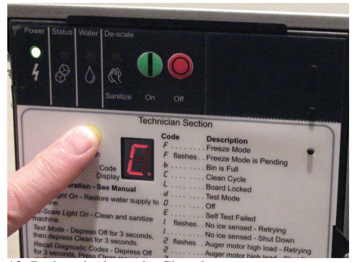
12. Push and release the Clean button.