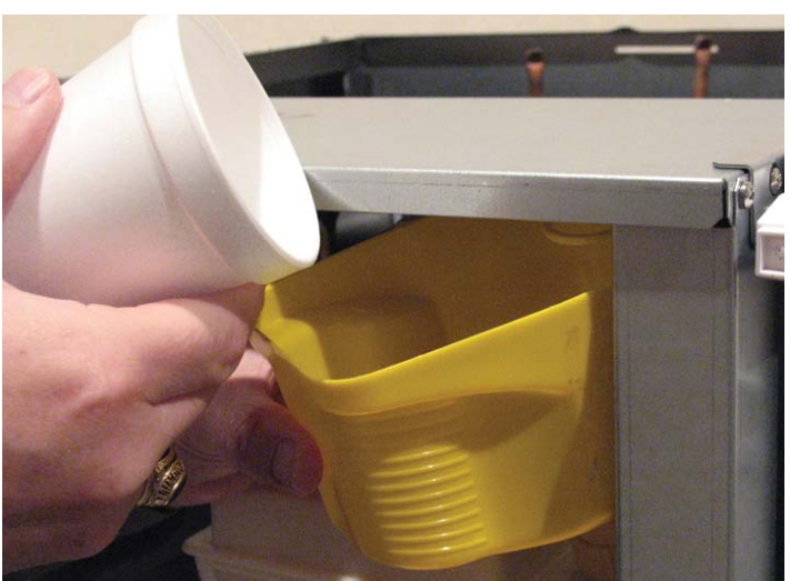
11. Add scale remover solution to reservoir.