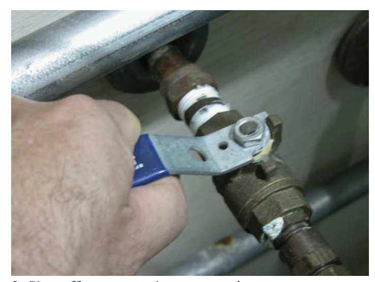
3. Shut off water supply to reservoir.