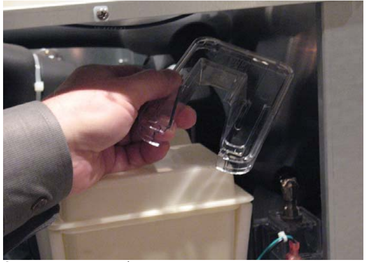
8. Remove reservoir cover.