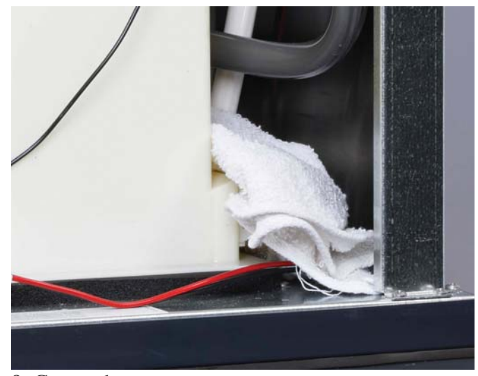
9. Cover photo eyes.