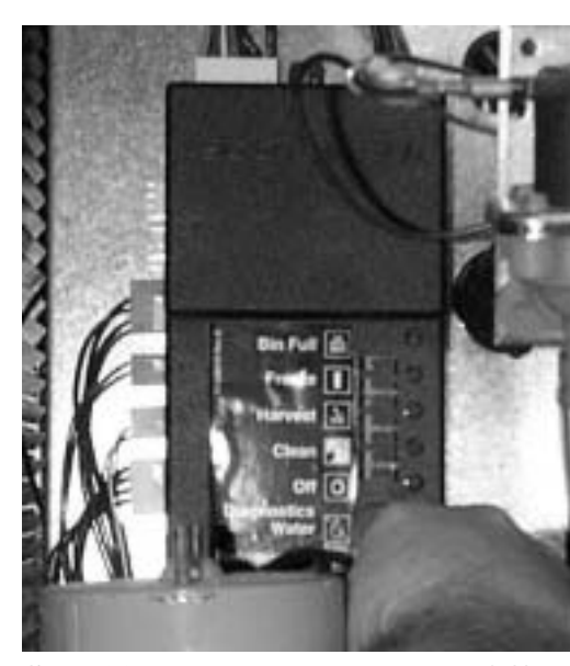
Step 11: Push and Release the Off Button