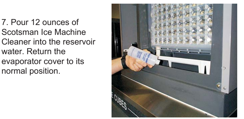
Step 7: Pour Ice Machine Cleaner Into the Reservoir