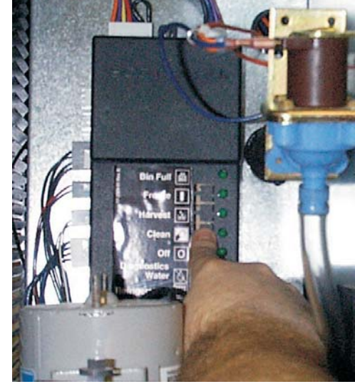
Step 6: Push and Release the Clean Button