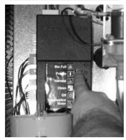
Step 21: Push and Release the Freeze Button

Use the balance of the sanitizing solution to sanitize the interior of the ice storage bin.