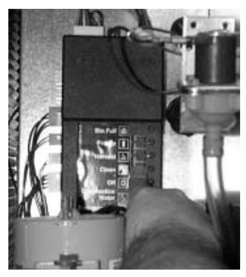
Step 14: Push and Release the Clean Button

Use the balance of the sanitizing solution to sanitize the interior of the ice storage bin.