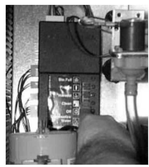
Step 9: Push and Release the Clean Button

Note: Some sanitizers must be rinsed off and some must air dry.